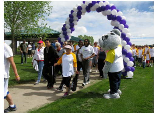
The Walk begins!