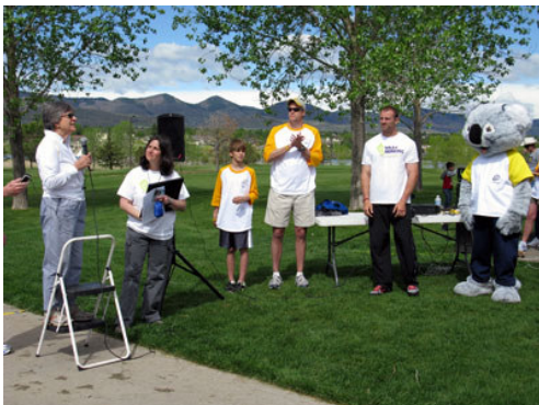
Speakers just before the walk