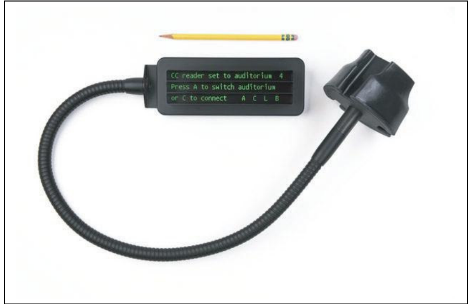
The new CaptiView cinema caption device. The bottom part is inserted into the seat arm cup holder. The flexible long

pole is adjusted to position the viewer (with the captions displayed on it) for the person's most comfortable viewing position. □