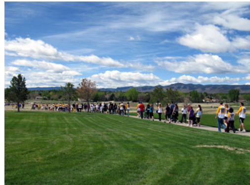
The Walk under scenic skies