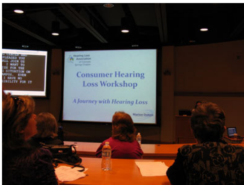
Just prior to the start of the workshops