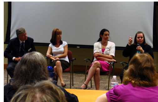
The Professional Panel answering questions