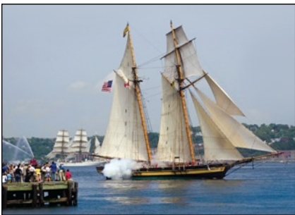
Visit the historic harbor.