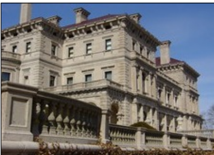
Tour the fabled mansions of the Vanderbilts and others in nearby Newport.

Make your plans now to set sail for historic