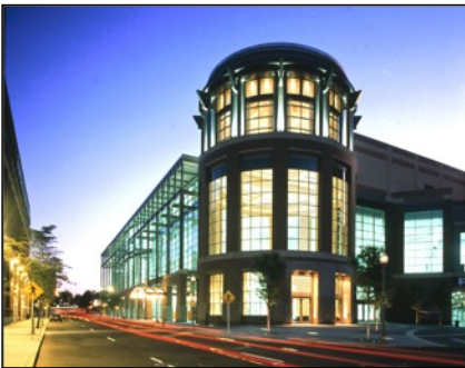
Attend workshops in the state of the art convention center.