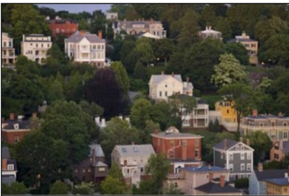
See colonial homes still in use.